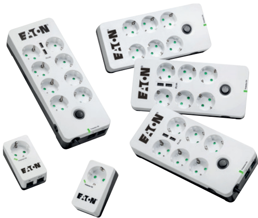
Eaton Protection Box range