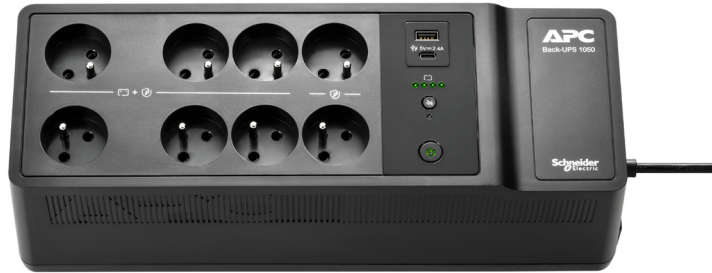
Model shown: BE1050G2-FR