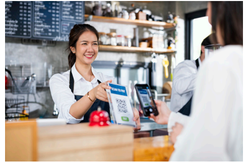
Point of Sale